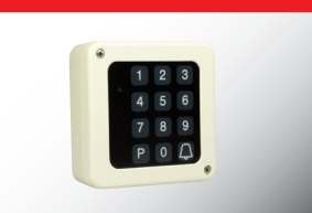
The Digi-Pad - a highly convenient extra.