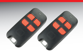
Two MIDI-handsets shipped as standard