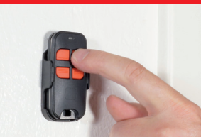
One wall holder is supplied as standard