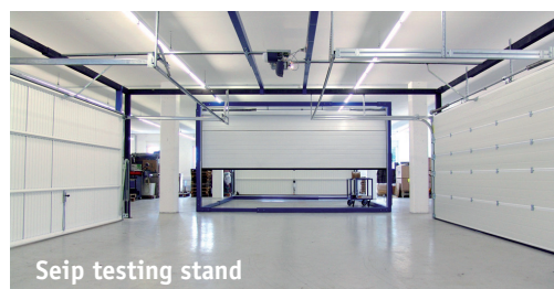
Seip testing stand

Modul „GT“: provides either separated impulses for opening and closing operations OR a partial opening feature which is handy for side-running sectional doors.