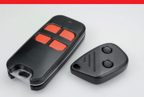
The optional MINI-handset compared to the standard MIDI-hand transmitter